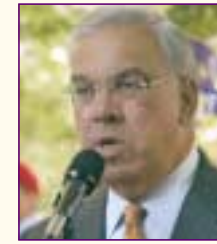
— Boston Mayor Thomas M. Menino

"This campaign is about insuring the long-term sustainability and prosperity of our city. The healthcare sector is the backbone of Boston's economy... but it's important that you and your family have good healthcare and good benefits. We've already done this at Boston Medical Center. They have 1199SEIU—why can't every hospital in the city of Boston have 1199SEIU?"